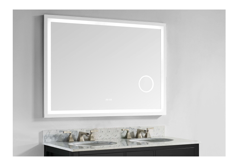
(Items other than the mirror shown in the picture above are not included)